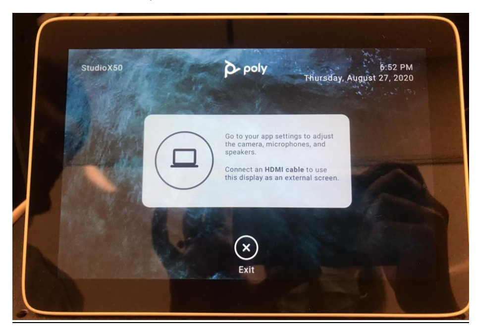
This is What Your Zoom Audio Settings Should Be Set To

When using the Aerobics room Make sure that the computer behind the two TVs is on and that the touch panel is on "Device mode" The touch panel should look like this.